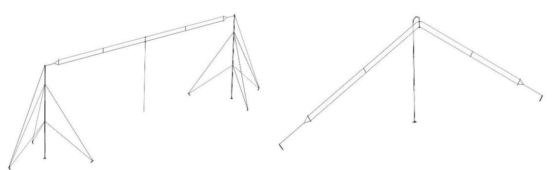
Figure 1 – Installed Antenna: Horizontal and Inverted-V installations

The Lencom® LB00 range of two-wire folded broadband dipoles is designed for fixed station, multi-frequency operation, and covers the entire frequency range of 2-30MHz with a power rating of 150W PEP (100W average).