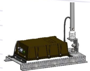
Figure 2 - Base with 4006

The platform is designed to securely attach the 4006 automatic tuning unit, but the whip can be used with other tuner variants. The whip is 7.7m long and produces an omnidirectional radiation pattern. The length of the whip dramatically improves the efficiency of the tuning unit.