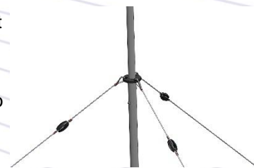
Figure 3 - Insulated Guys

The guys are attached using dielectric guy plates and are insulated to avoid any impact on the radiating element.