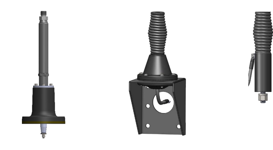
Figure 2 - Matching Bases: 02-4010, 02-4021, and 02-4022 (right to left)