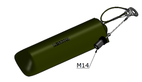
Figure 1 - Antenna kit and bagged kit

The Lencom® 02-2181 long-wire antenna kit is designed to extend the efficiency of Lencom automatic tuners antennas when a vehicle is stationary