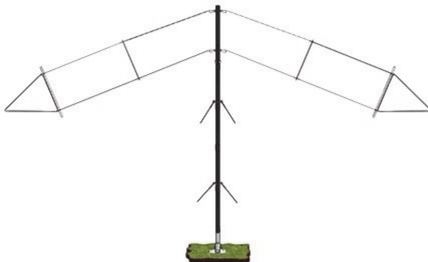
(Fig 1. Antenna and mast shown truncated for clarity)

The Lencom 1003 series combines a 2-30MHz folded dipole antenna with an extremely light-weight 10m aluminium mast.