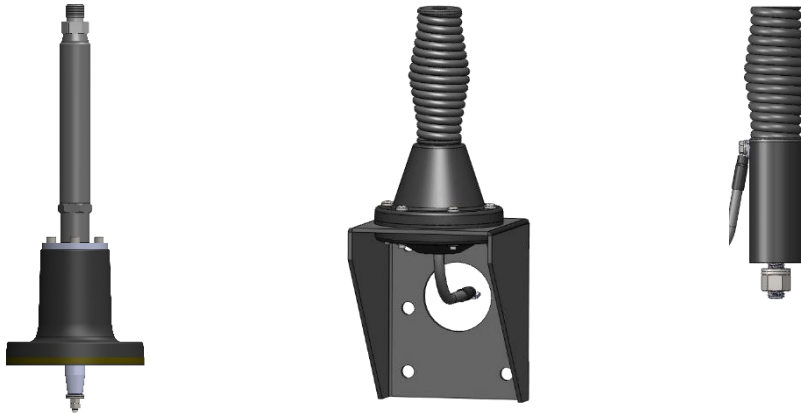
Figure 2 - Matching Bases: 02-4010, 02-4021, and 02-4022 (right to left)